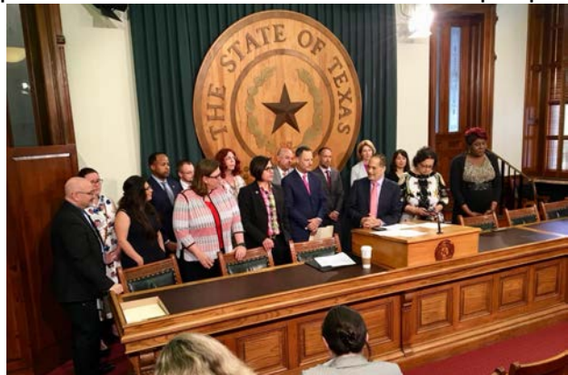
HB 1513 Press Conference

HB 1513 aimed to protect victims of crimes committed based on bias against the victim's gender identity or expression. I have filed this bill for the last 7 sessions.